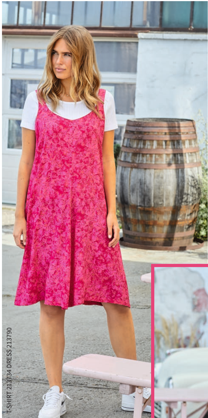
T-SHIRT 213734 DRESS 213790