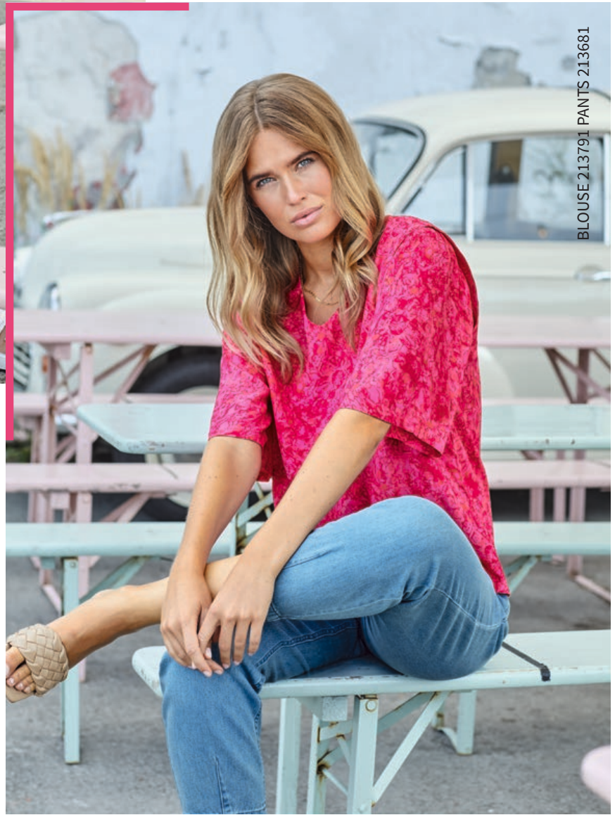
BLOUSE 213791 PANTS 213681